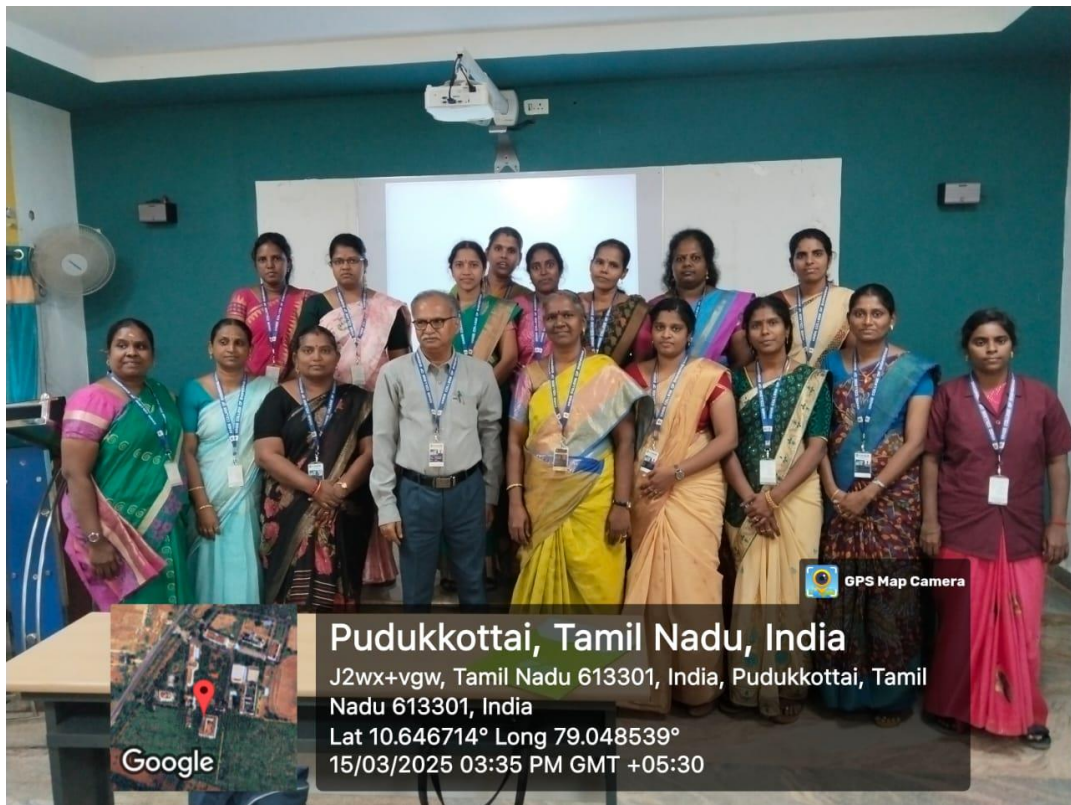
Resource Persons along with Participants